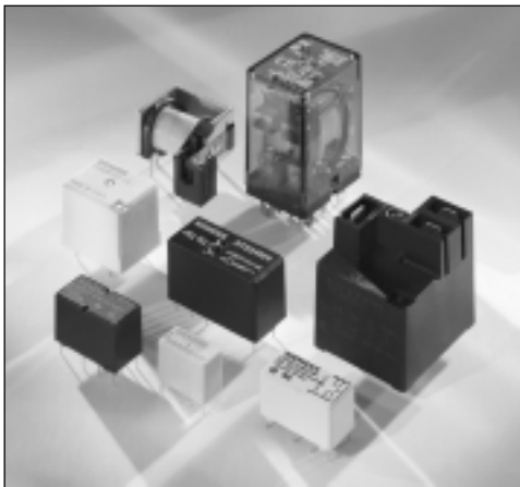
Figure 1. Tyco Electronics printed circuit board relays. Shown are miniature relays designed for switching signals as well as power relays capable of switching up to 30 amps.

Incorrect handling and mounting of printed circuit board relays can alter the relay's operational characteristics and result in premature relay failure. Additionally, recommended conductor widths and PC board cleaning procedures play an important part in assuring that the assembly will yield long, reliable service.